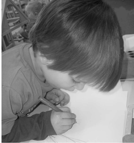
Figure 1.1 A young boy creates his own marks and signs (3 years)